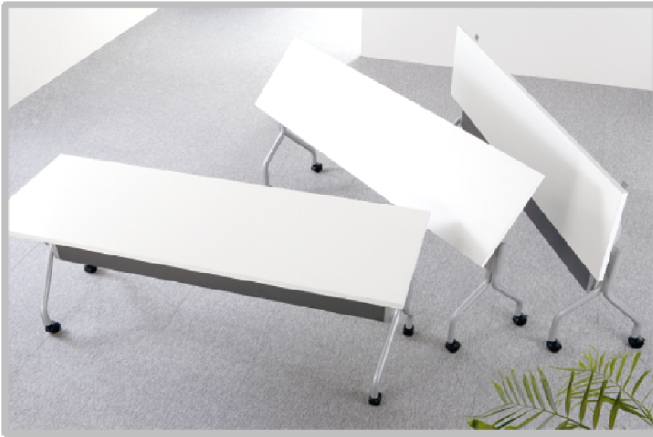
The legs are designed for straight nesting.