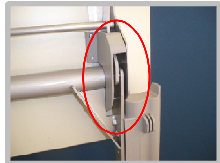
Safety mechanism for not getting the finger caught.