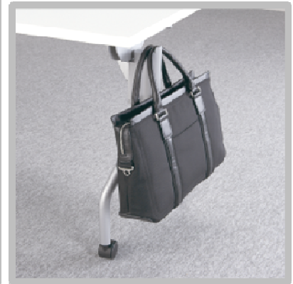
The resin hooks on both sides.