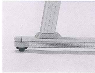
The brake system released