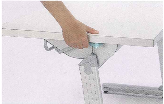
Even when in use, the brake system can be released easily by pushing down the brake release lever.